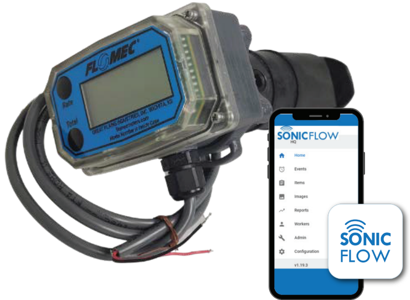
The SonicFlow System™

REPORT consumptive flow data automatically using the cloudbased SonicFlow Web™.