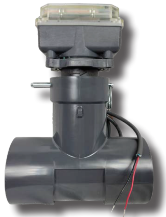
The SonicFlow Meter™

3-Way Flow Readings Bluetooth Beacon*Local Display*Irrigation Controller*